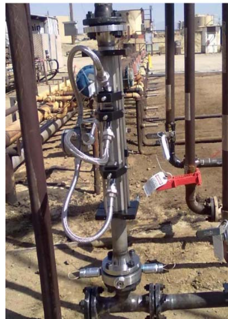
The Safire multiphase flowmeter undergoing extended testing

Multiphase flowmeters are also designed to perform measurement functions traditionally provided by multiple equipment types (e.g., separators, water cut meters), and in a smaller footprint – a real value in the expanding offshore market. Furthermore, multiphase flowmeters can also be designed to be deployed on a portable basis or in use with manifolds where they can dynamically measure multiple well heads.