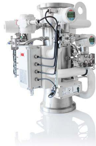
ABB's Vega Isokinetic Sampling (VIS) multiphase flow meter